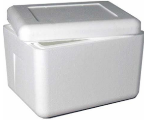
#6 FOAM COOLERS