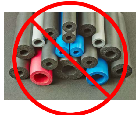
NO PIPE INSULATION