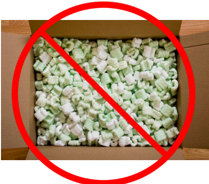
NO PACKING PEANUTS