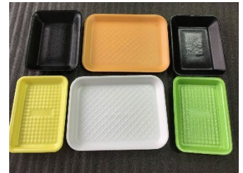
CLEAN MEAT & PRODUCE TRAYS