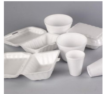
CLEAN #6 PLATES & CUPS