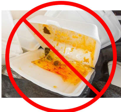
NO DIRTY FOAM PRODUCTS