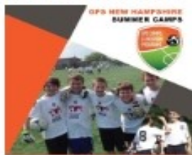
FRANKLIN SUMMER SOCCER CAMP

The Franklin Opera House and the Franklin Parks and Recreation Department are proud to sponsor F.A.C.T (Franklin Area Children Theater) for children. Children will have the chance to work with a trained theater director, and learn basic on-stage theater skills as well as technical aspects of theater to present "The Big Bad Musical".