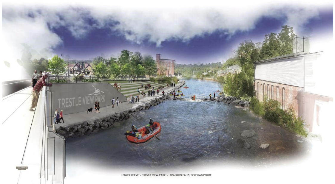
LOWER WAVE - TRESTLE VIEW PARK - FRANKLIN FALLS, NEW HAMPSHIRE

Local Government/ Volunteer Opportunities 17