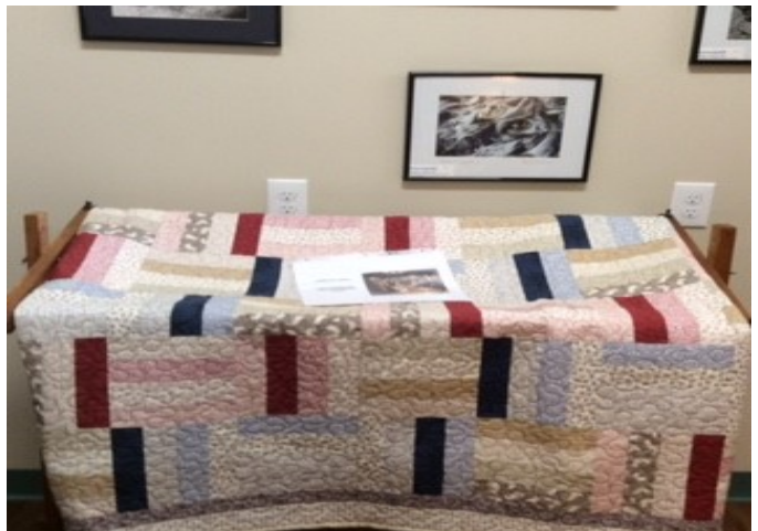
Downtown Abbey Quilt