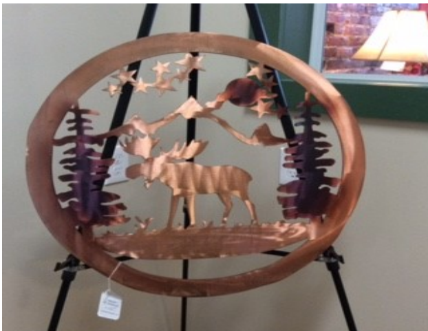
Third Shift Fabrication, LLC Copper deer metal fabrication

Raffle tickets are available now at the Franklin Studio. Prizes are valued at $175 each. Drawings will be held at noon on September 3.